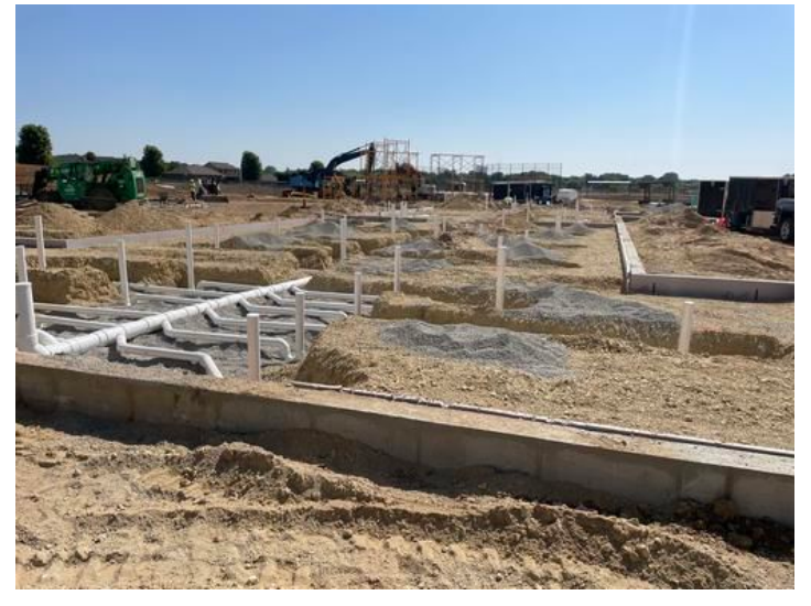
Underground plumbing Bath House interior Taken on Jun 9, 2023, 10:04 AM CDT Added on Jun 9, 2023, 11:01 AM CDT