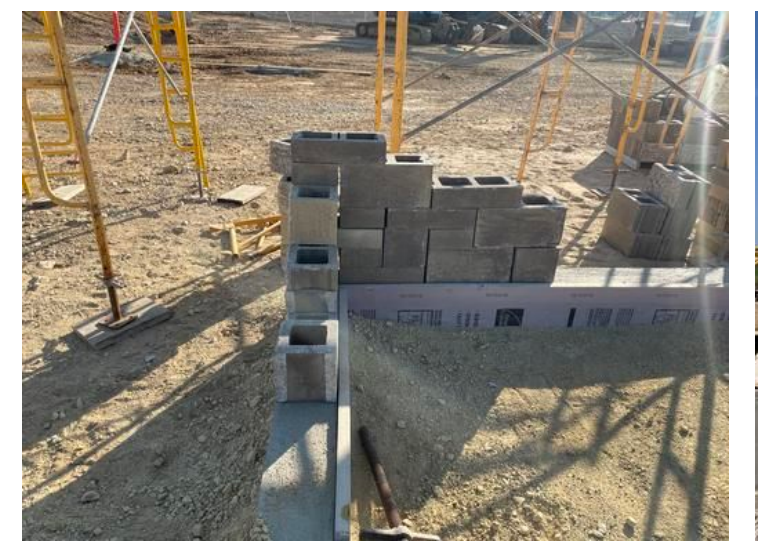
Masonry layout of blocks Taken on Jun 9, 2023, 7:40 AM CDT Added on Jun 9, 2023, 11:16 AM CDT